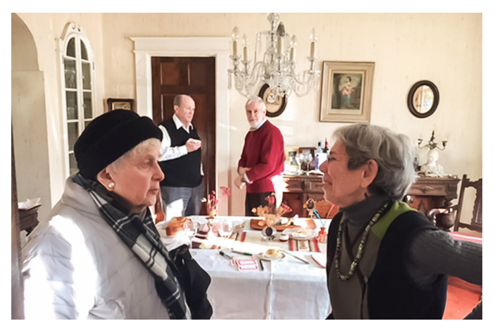
HomeHaven News February 2018 Page 5